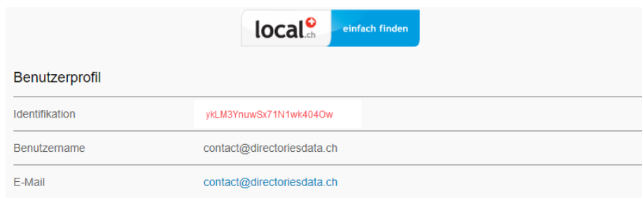
Figure 1: OAuth User Profile with «Identification» and «Username»